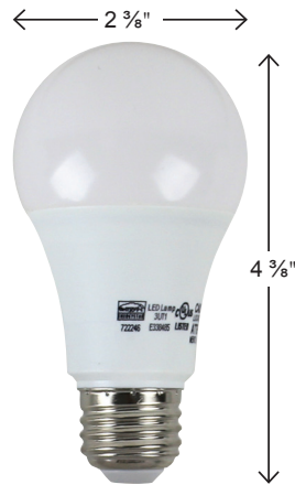
LCE26-9W A19 LED Lamp 9.5 Watt, 3000K, 800lm Replaces up to 60W Incandescent

Easily Convert existing residential fixtures to LED with E26 Medium Base LED Lamps. These lamps are for enclosed fixtures and replace up to 60W incandescent lamps. These are the perfect lamps to help reduce waste and conserve energy.