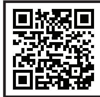
SCAN FOR VIDEO

Wave Lighting's 166FM adds a modern look to any outdoor space. This fixture is ETL Listed and IP65 rated. The 166FM is double gasketed with a twist-lock lens for a water and bug-proof tight seal. Wave Lighting's 166FM is designed for wall or ceiling applications and mounting hardware is included. Options include Emergency Backup with 135 minute runtime and Occupancy Sensor.