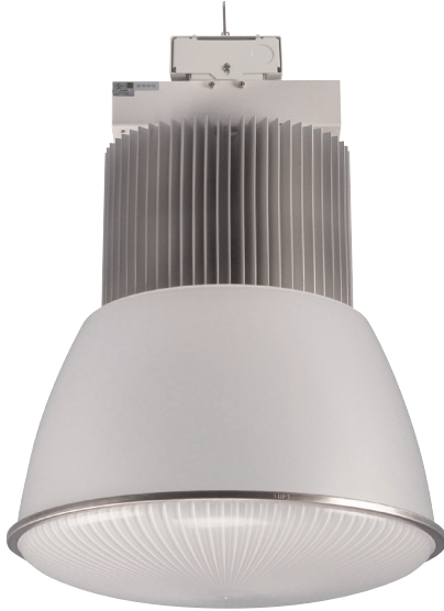
(frost reflector with optional frosted dome lens shown)

Wave Lighting's Industrial LED High Bay Fixtures are designed to improve visibility and worker safety in warehouses, recreation centers and storage facilities. Our LED High Bay is maintenance free with up to 50,000 hours of uninterrupted life and is suspension mounted with a spring hook (included).