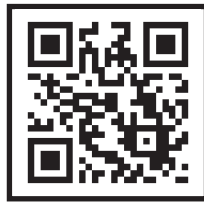
SCAN FOR VIDEO