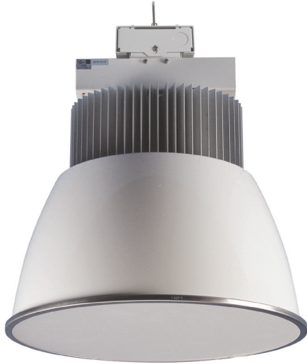
(reflective white reflector and optional frosted flat lens shown)

Wave Lighting's Industrial LED High Bay Fixtures are designed to improve visibility and worker safety in warehouses, recreation centers and storage facilities. Our LED High Bay is maintenance free with up to 50,000 hours of uninterrupted life and is suspension mounted with a spring hook (included).