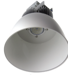
Open Shown without Lens Options