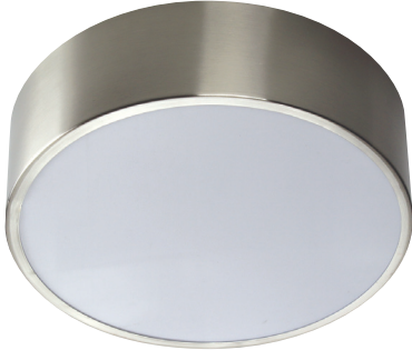
PENDANT KIT 6"/13" Pendant