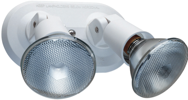
LAMPS NOT INCLUDED

Illuminate any outdoor walkway with Wave Lighting's 15RP2. This fixture is ETL Listed. Wave Lighting's 15RP2 is designed for wall applications and mounting hardware is included. Options include photocell.