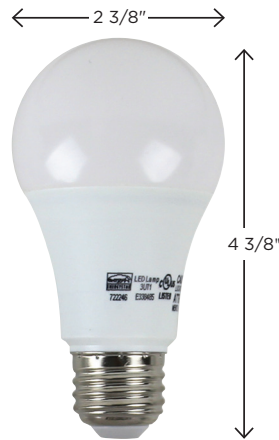
LCE26-9W A19 LED Lamp 9.5 Watt, 3000K, 800lm Replaces up to 60W Incandescent JA8 Compliant

Easily Convert existing residential fixtures to LED with E26 Medium Base LED Lamps. These lamps are for enclosed fixtures and replace up to 60W incandescent lamps. These are the perfect lamps to help reduce waste and conserve energy.