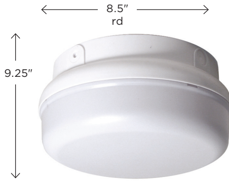
165FM-WH H/CTR: 4.5" BACKPLATE: 8.5" rd