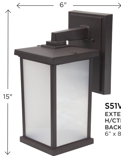
S51V EXTENDS: 8" H/CTR: 2.5" BACKPLATE: 6" x 8.75"