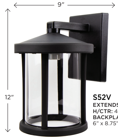
S52V EXTENDS: 8.5" H/CTR: 4" BACKPLATE: 6" x 8.75"