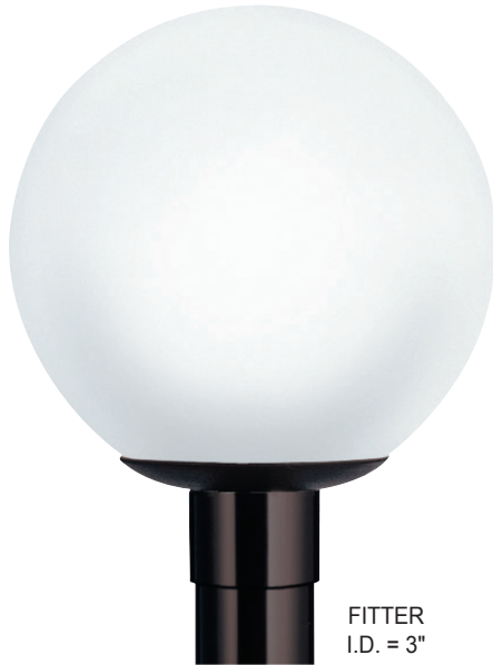
FITTER I.D. = 3"