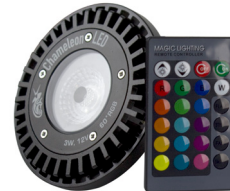
12V LED lamp included RGB models (R) include remote

Wave Lighting's Low Voltage LED Post lanterns are equivalent to a 50W halogen lamp. Standard 3000K along with color changing RGB 12V LED lamps are available. Our post mount 12V fixture allows for an easy lighting addition to a landscape environment with an existing 12V transformer. 10' direct burial wire lead included for easy install.