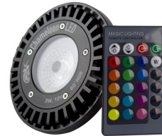
12V LED lamp included RGB models (R) include remote

Wave Lighting's Low Voltage LED Post lanterns are equivalent to a 50W halogen lamp. Standard 3000K along with color changing RGB 12V LED lamps are available. Our post mount 12V fixture allows for an easy lighting addition to a landscape environment with an existing 12V transformer. 10' direct burial wire lead included for easy install.