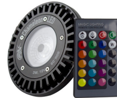
12V LED lamp included RGB models (R) include remote

Wave Lighting's Low Voltage LED Post lanterns are equivalent to a 50W halogen lamp. Standard 3000K along with color changing RGB 12V LED lamps are available. Our post mount 12V fixture allows for an easy lighting addition to a landscape environment with an existing 12V transformer. 10' direct burial wire lead included for easy install.